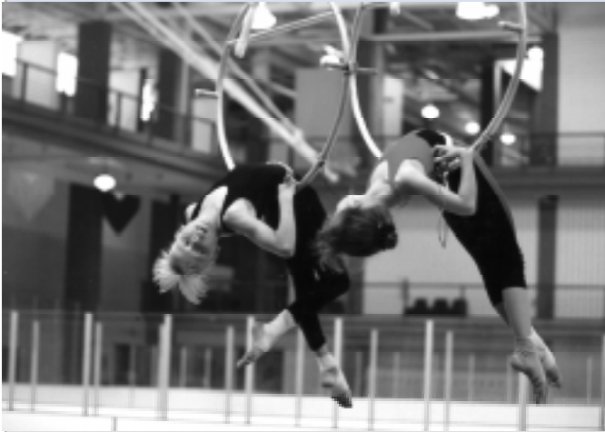
Performers train for the premiere of Cirque Ingenieux at Texas A&M University

As Texas A&M University pursues excellence and top public university status, we must not only empower our graduates to think critically, analyze complex problems, and offer solutions, but also to be culturally prepared to meet global challenges in their careers.