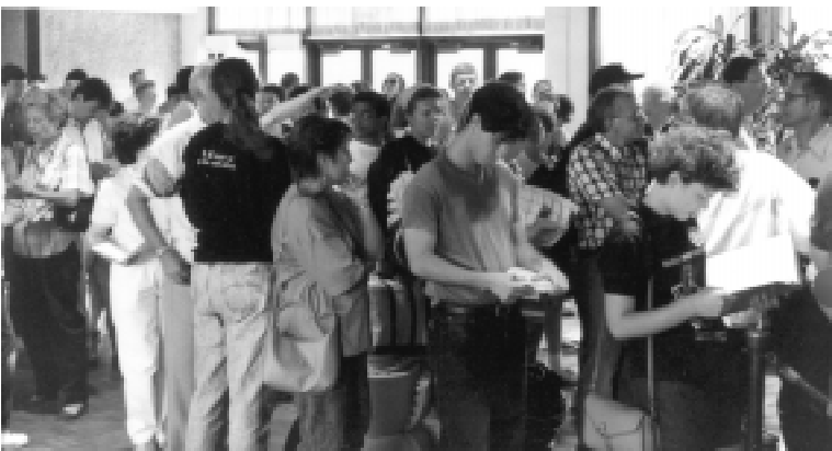
Students wait in line to purchase tickets to the world premiere of The Bolshoi Ballet Grigovich Company