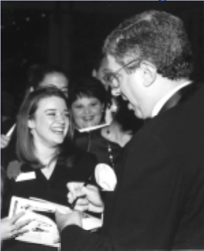
Marvin Hamlish meets with students

By enabling access to internationally recognized performances, MSC OPAS provides students and the wider University community with access to a level and diversity of cultural performance otherwise unavailable; by subsidizing ticket prices for students, we help ensure that cost will never keep any Aggie from attending these performances.