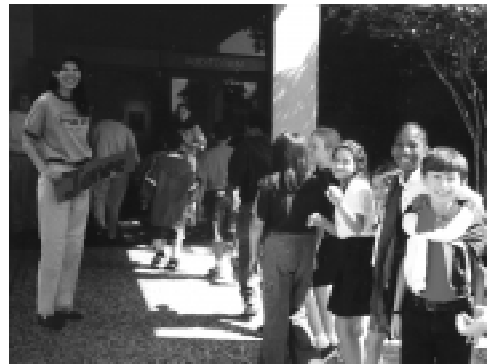
OPAS students building the audience of the future through local outreach of OPAS Jr.