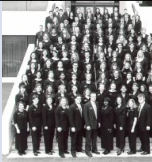
MSC OPAS 2000-2001 Student Committee

By virtue of our unique structure, MSC OPAS provides hundreds of students with valuable leadership experience. Each year, some two hundred Aggies participate directly in the planning, coordination and management of this nationally recognized fine arts series; they further benefit from doing so under the guidance and direction of a talented and experienced professional staff.